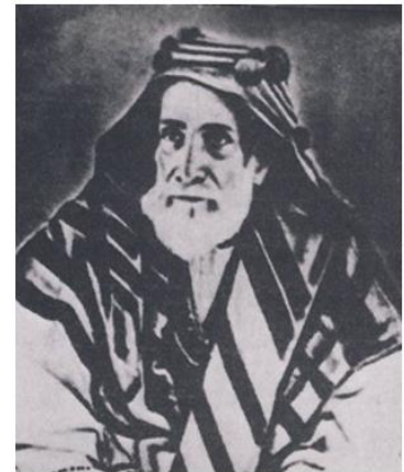
Shaikh Isa bin Ali Al Khalifa Hakim of Bahrain 1900